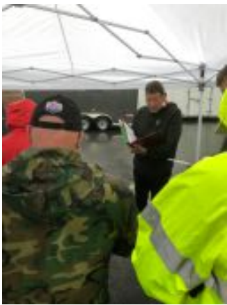
Outdoor service held during Bellefonte's Soap Box Derby

In the summer months ahead, many of us will be traveling to various places. I encourage you to visit the local Episcopal church where you are staying and to continue to have Christ in your daily lives as well. The Clergy Gathering recently reminded me