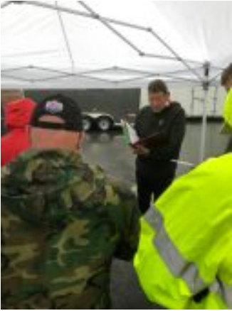
Outdoor service held during Bellefonte's Soap Box Derby

In the summer months ahead, many of us will be traveling to various places. I encourage you to visit the local Episcopal church where you are staying and to continue to have Christ in your daily lives as well. The Clergy Gathering recently reminded me