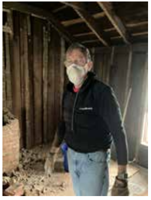
crew for recent repairs to the rectory bathroom.